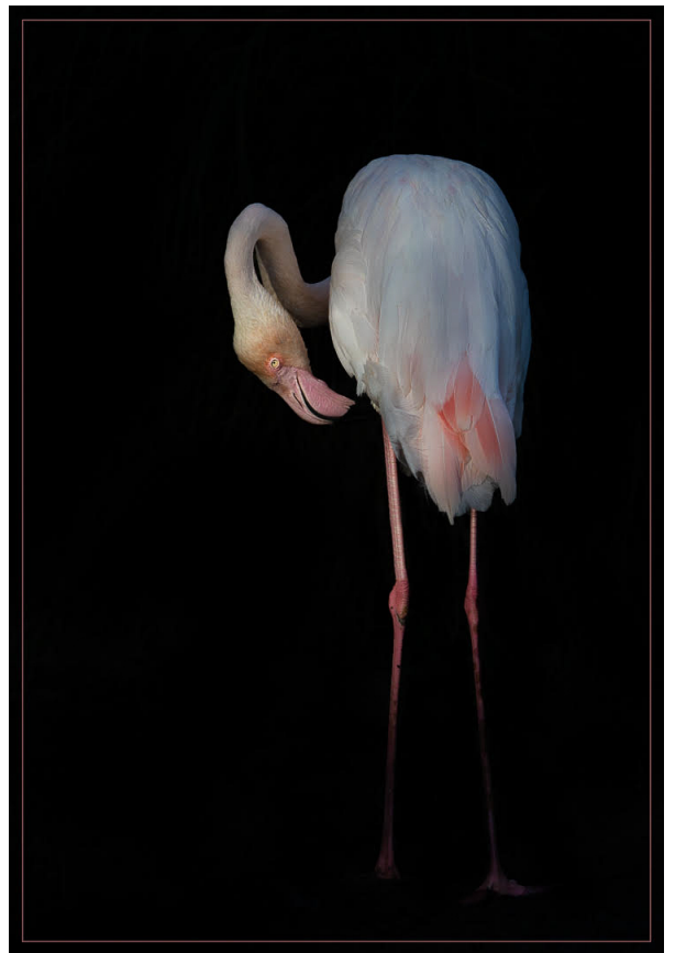
Lynn Fothergill "Flamingo"