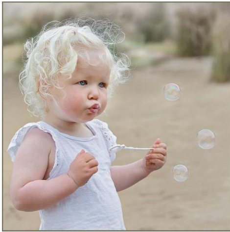
I'm Forever Blowing Bubbles by Lynn Fothergill Highly Commended