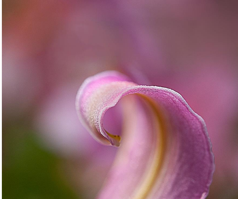
Curvaceous by Pauline Smith Honours

No Photo as was competition only Into the Light by Dennis Tohovaka, Open Image of the Night