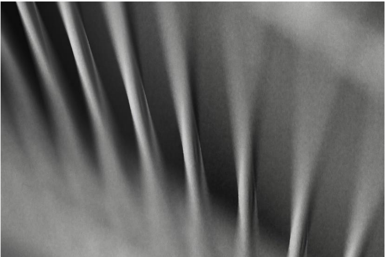
Plucking at My Strings by Lee Waddell, Set Image of the Night Honours Set Image of the Night